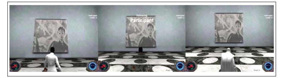
Figure 3. TAT picture 8BM (boy and surgery) from the perspective of male participants using avatars in doctor, control, and KKK uniforms

After the training session, the participants were asked whether they understood the guidelines of the writing task and whether they felt comfortable when operating their avatar. If that was the case, they were invited to stroll along the museum's corridor and enter one of the two rooms housing each TAT picture. The presentation order of the pictures was alternated by the experimenter, who told participants which of the two virtual rooms to enter first. The experimenter advised the participants to stay in a picture room until the story was completed to avoid stories merging the attributes of both pictures, comparisons between pictures, and the like.