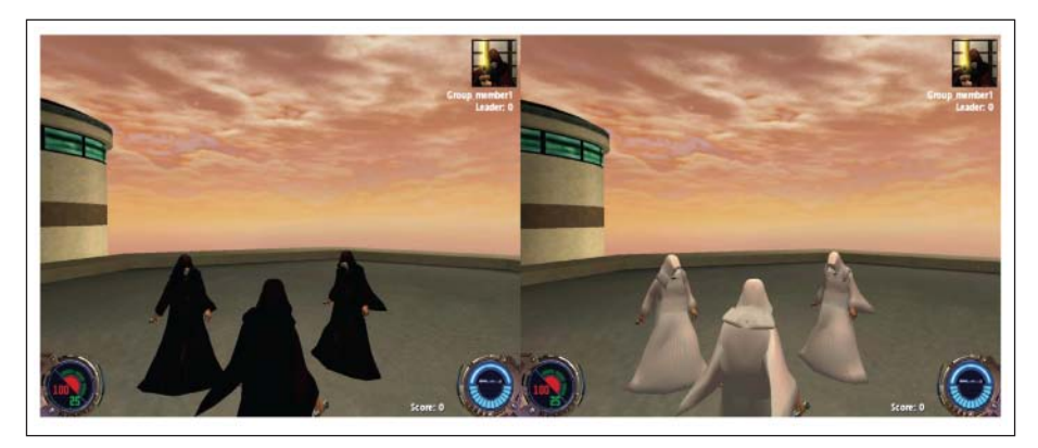
Figure 1. Virtual group discussions with black- and white-cloaked avatars

and the majority of them were native English speakers. The mean age of the participants was 19.84 (SD = 2.61). Participants had spent ample time using personal computers (M = 10.16 years, SD = 2.85 years), but video game experience in the sample was lower on average (M = 4.68 years, SD = 5.74 years). All participants were assigned to three-person virtual groups (N = 17) and communicated exclusively via text messages sent within the virtual reality.